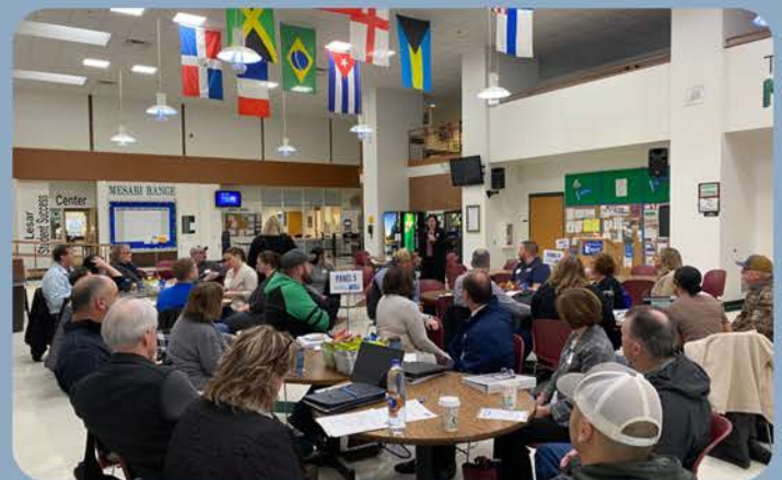
MARCH 2025 | MN NORTH COLLEGE (VIRGINIA CAMPUS)

CSI support assists with facility rental costs as well as food and materials for volunteers.